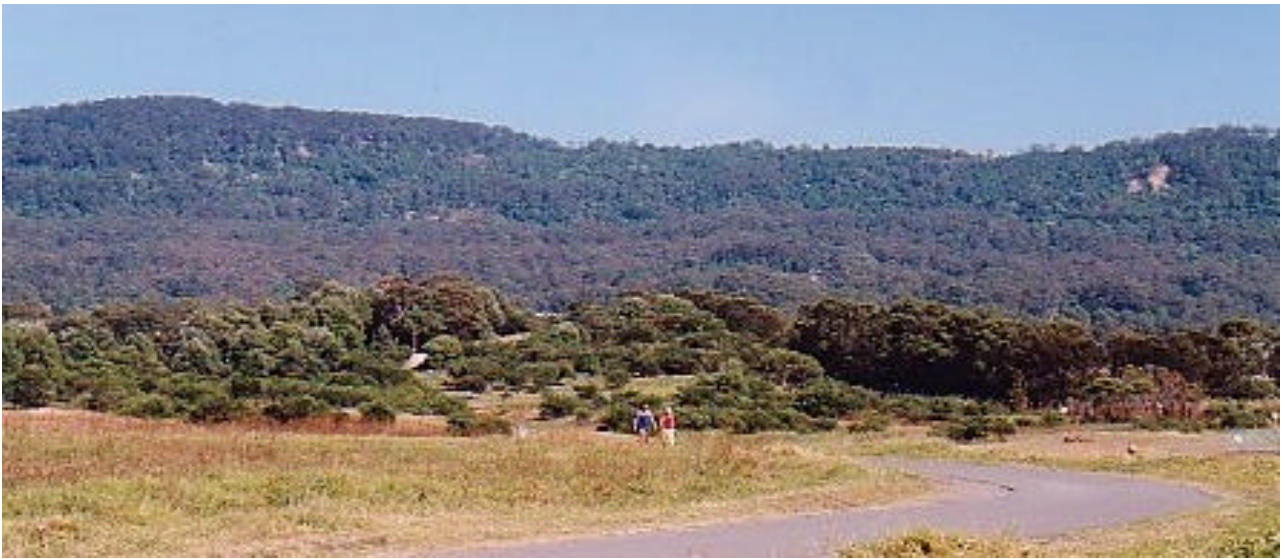
Looking west across the Sandon Point site to the Illawarra Escarpment

Bushland Management Strategy 2003 and beyond